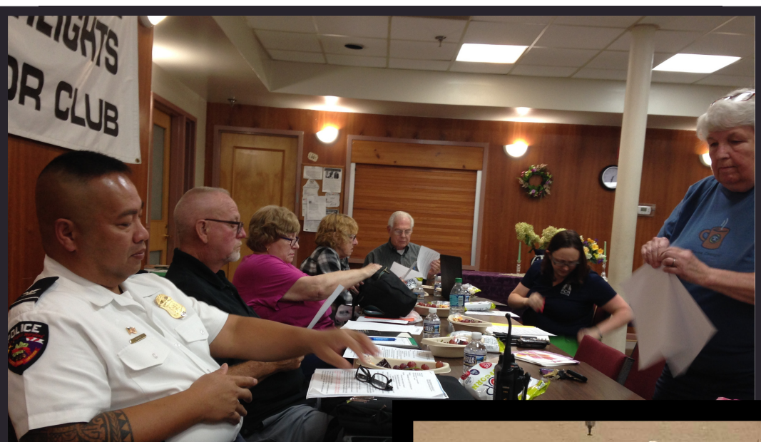
tings this will be ne Counci ession to the buncil will ssion to