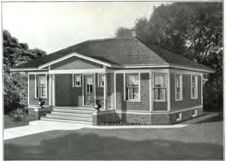
Harris Home No. L-1007