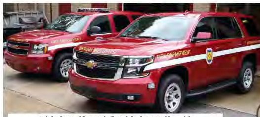
Chief 14 (front) & Chief 14A (back)

BHVFD operates three Chief "buggies" or vehicles, one of which being the only County-owned apparatus in the station. Chief 14 has a 2015 Chevy Tahoe, Chief 14A has a 2012 Chevy Tahoe, and Chief 14B has a (County owned) 2006 Chevy Impala.