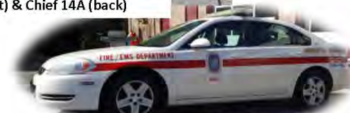
Chief 14-B 2006 Chevy Impala (County-Owned)