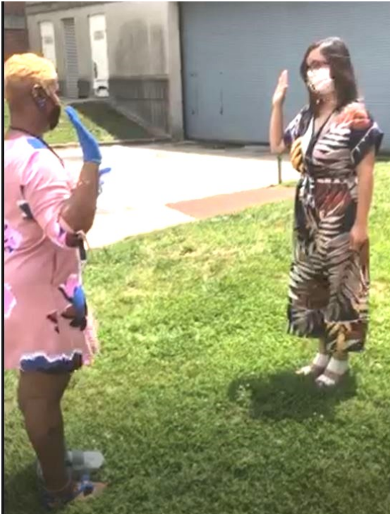
Mayor Amanda Dewey is sworn in by Clerk of the Circuit Court in Upper Marlboro, June 10, 2020. The remaining Councilmembers were sworn in by Mayor Dewey at the June Town Meeting.

Check the Town website for the latest updates https://www.berwynheightsmd.gov/