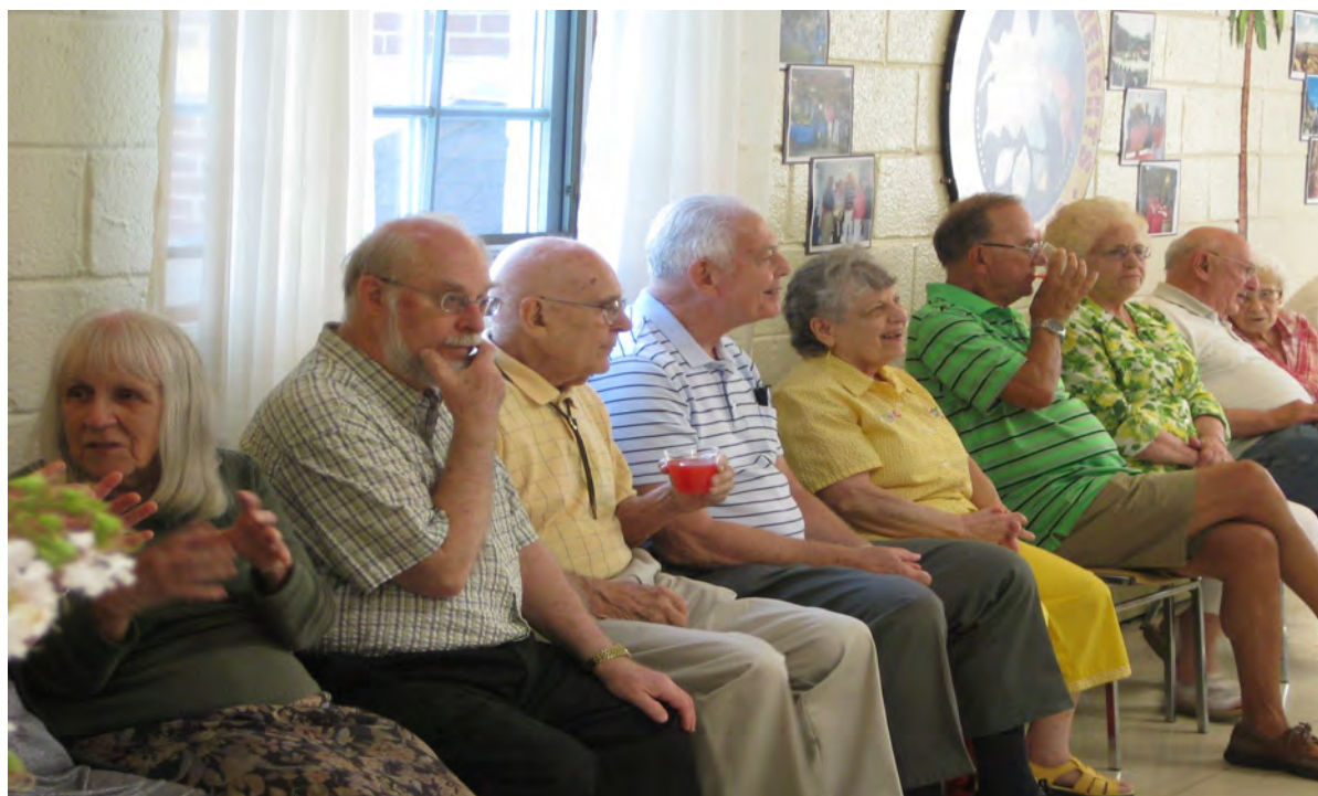
Seniors in Attendance at the Reception for Former Berwyn Heights Mayor Cheye Calvo July 10, 2015