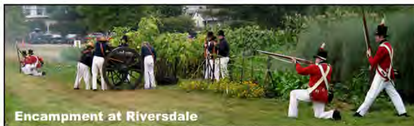
Encampment at Riversdale

War's battles took place right here in Prince George's County! Top-notch reenactments of the battles, arts and culture of the times are within your reach through our partnership with the Anacostia Trails Heritage Area.