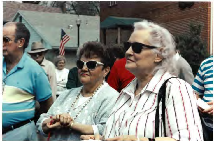
Town Office Dedication Ceremony 1992: Who Are These Guests?

Also on display, Town photo albums from 1960s, 1970s and 1980s. Help us identify people and events, and bring your own old photos of our Town to show, if you like.